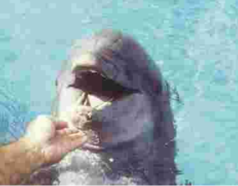
The laceration to the lower tip of this dolphin's jaw is exposed to a visitor's touch.

members of the public can participate in a Petting Pool feeding session than a SWTD session and, although visitors are not in the water with the dolphins in Petting Pools, they may have at least as much hands-on contact with the animals. We therefore believe that the ratio of staff to visitors at Petting Pools needs to be at least equivalent to the former SWTD requirements - to ensure control over the nature and extent of interactions between visitors and the dolphins and the safety of both parties.