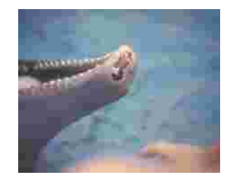
LEFT AND ABOVE: Evidence of injuries, both new and old, can be found in Petting Pool dolphins. Photo: WDCS

Several Petting Pool dolphins are obese, despite a legal obligation to adjust captive dolphins' food intake to ensure a "normal state of good health". Photo: WDCS