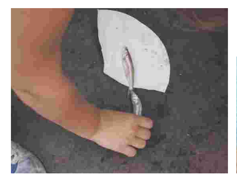
LEFT: Visitors have been observed feeding the dolphins with fish that have been dropped and stepped on.