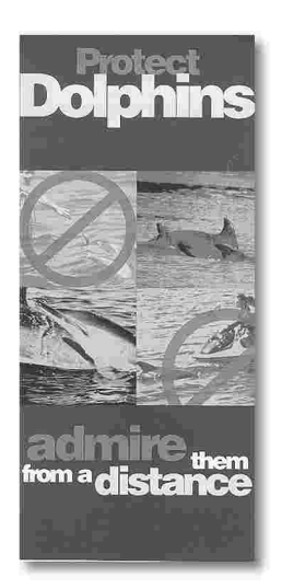
The US government has launched a public campaign to deter feeding, touching and swimming with dolphins in the wild.